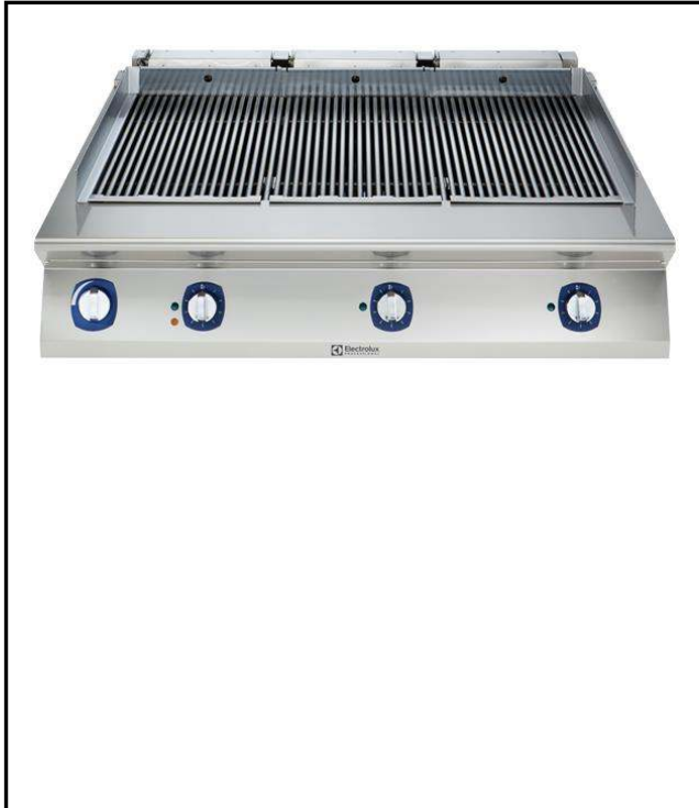
371268 (E7GRELGS0P) Large electric Grill Top - HP